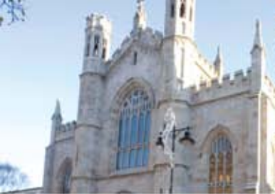
The Cathedral of St Patrick & St. Colman