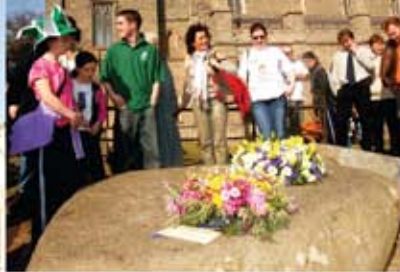
St Patrick's Grave