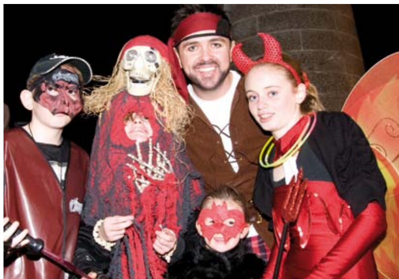
Cool FM's Pete Snodden with Halloween festival goers in Newcastle.