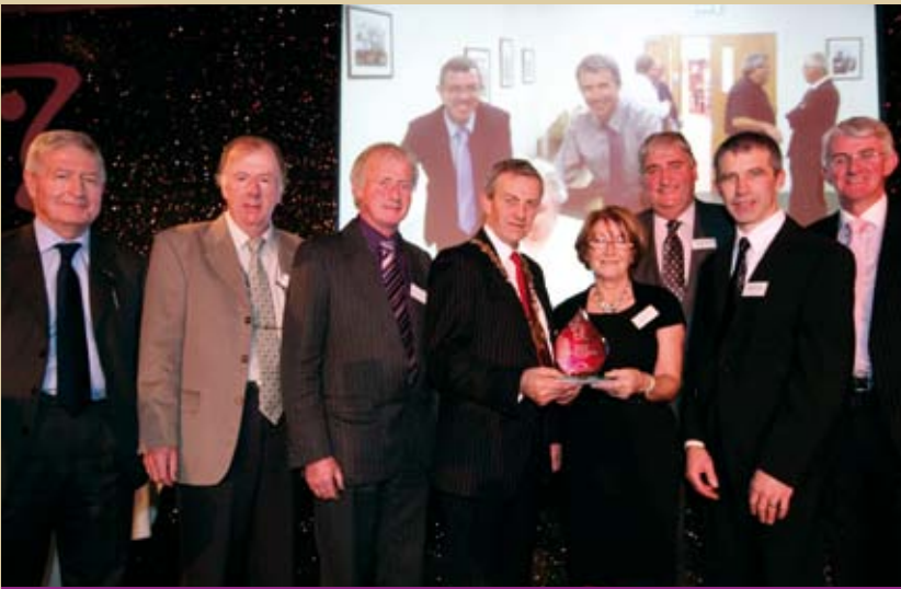
The Management Committee of The Lodge Cultural, Community and Business Centre, Castlewellan were delighted to be runner-up in the category of 'Heritage' in the all-Ireland competition.