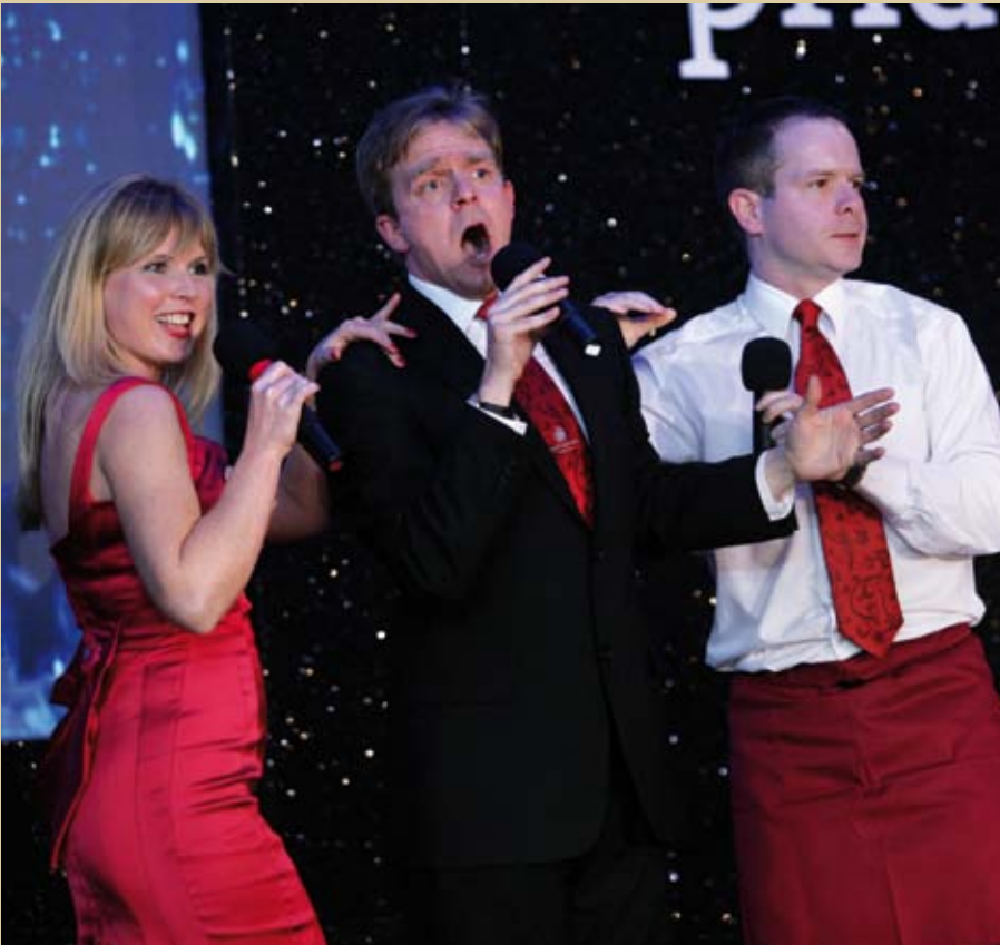
Entertaining the audience with a unique combination of surprise, comedy and opera.