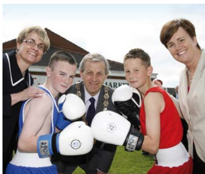
Local members of ABC Pegasus Boxing Club join the Chairman of Down District Council, Councillor William Dick, DSD Minister Margaret Ritchie and Education Minister Catriona Ruane to launch the commencement of the £4.1m Ballymote Project in Downpatrick.

Down District Council obtained funding of £1.3 million from the Department of Agriculture and Rural Development to implement an environmental improvement scheme in Ardglass. The scheme included new kerbs, provision of additional car parking, a planting scheme, feature lighting and new street furniture. An enhancement scheme was also undertaken at Castle Park and a new play park created at Quay Street.