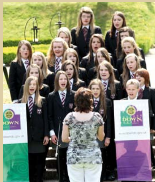
Pupils from Saintfield High School provide a delightful musical backdrop to the afternoon's proceedings.