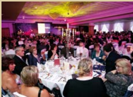
Almost 500 distinguished guests attended the glittering gala awards ceremony.