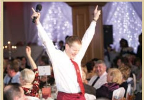
The wine waiter bursts into spontaneous song.