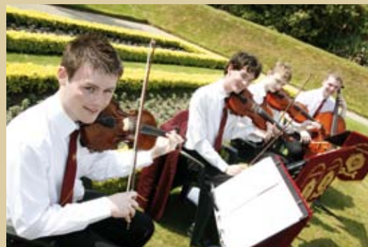
Pupils from St Patrick's Grammar School, Downpatrick entertain guests in the walled garden.