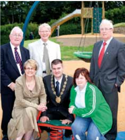
Marian Park Playground Opening.