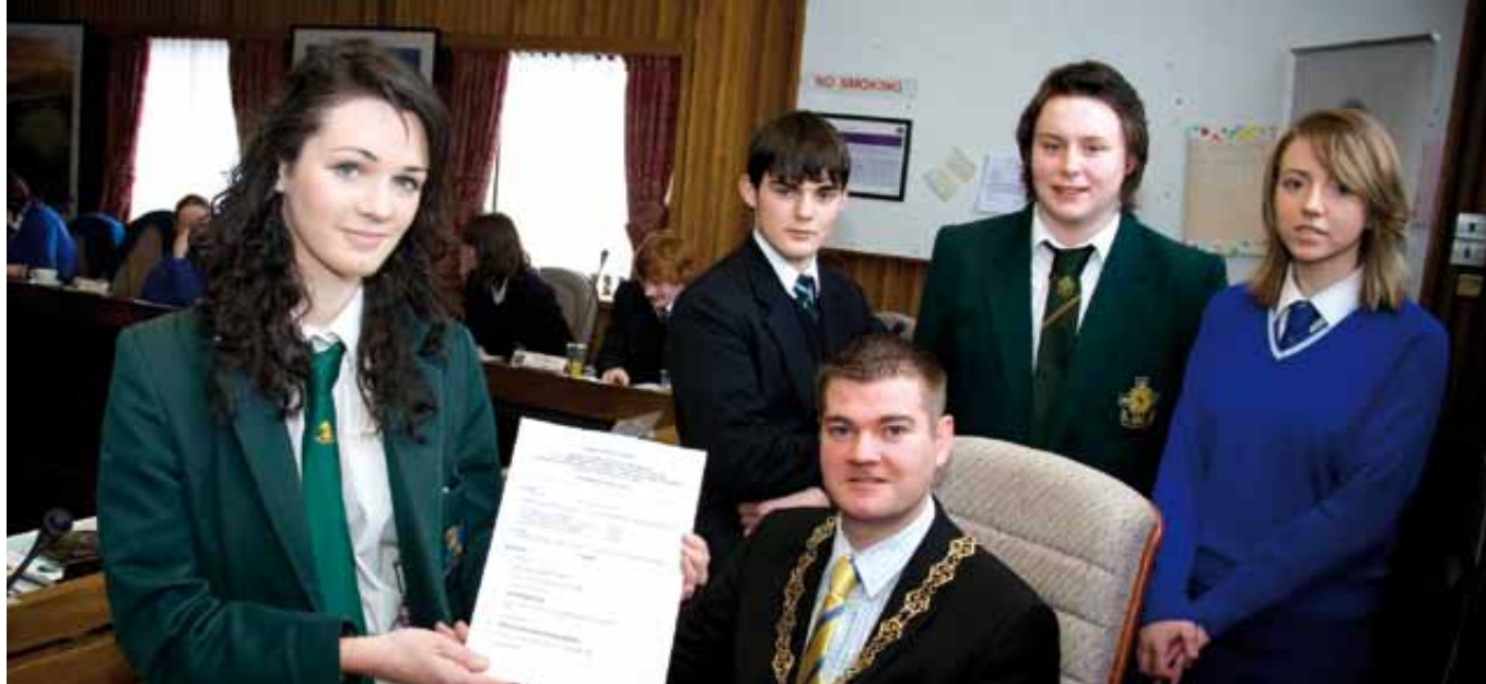
Council Chairman is joined by students from Down High School, Blackwater Integrated College, St Malachy's High School and Assumption Grammar School to experience a day in the life of a Councillor.