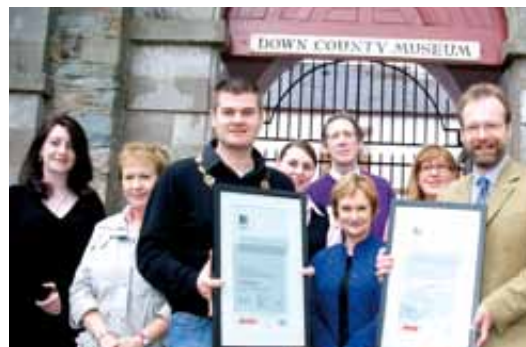
Down County Museum received two commendations at the Museum of the Year Awards 2008 - 2009.