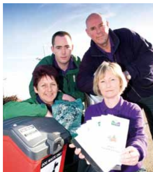
Enforcement Officers encourage responsible dog ownership.