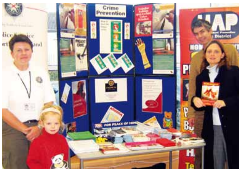
Home Accident Prevention Advice Information Day.