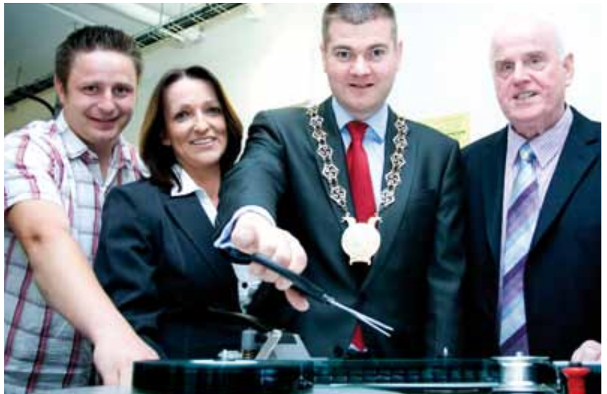
Opening of the Eclipse Cinemas in Downpatrick.