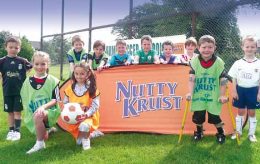
Soccer Funweek, Castlewellan.