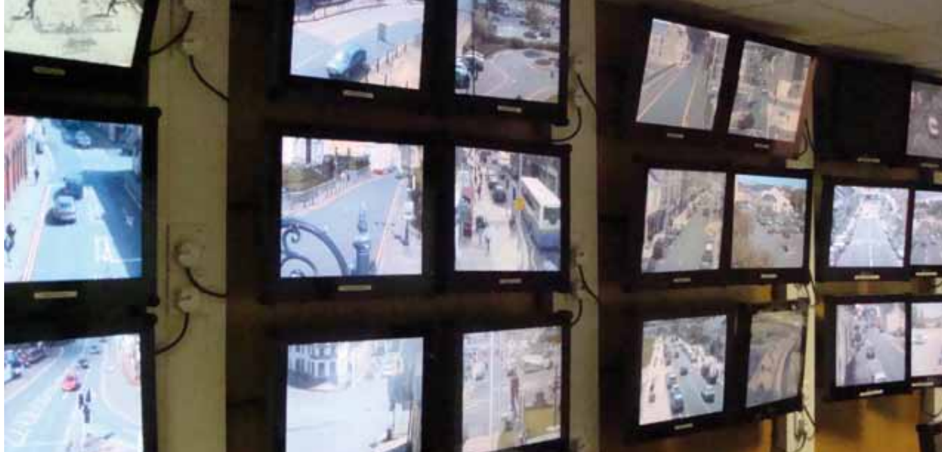
CCTV Monitoring Station for Ballynahinch, Downpatrick and Newcastle