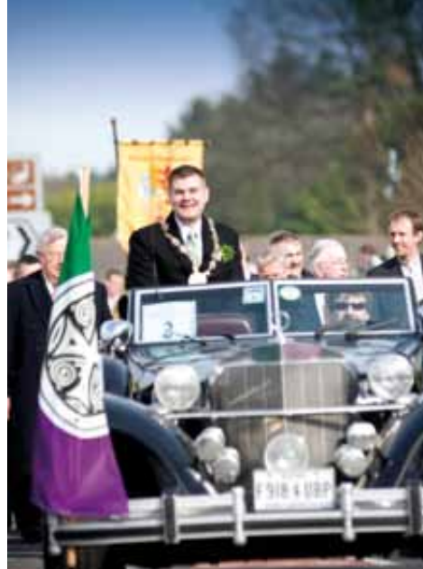
St Patrick's Festival 2009.