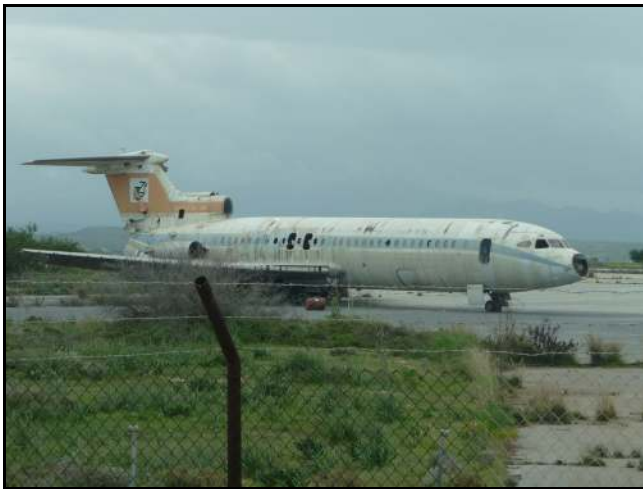
Nicosia, view of the buffer zone patrolled by the UN at the occasion of the inter-regional exchange visit to the occupied territory in Cyprus.

“The partners witnessed local organisations from across divided Turkish and Cypriot communities that have found ways of working together, building networks, co-operating on issues of common interest for positive change regardless of the political constraints, during a visit to Cyprus.