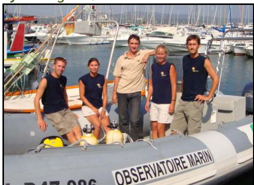
SIVOM Marine Observatory team

Service Observatoire Marin / SIVOM du Littoral des Maures (Marine Observatory)