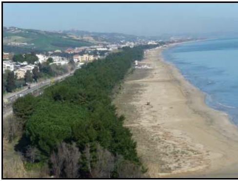
Teramo Coastal landscape, Italy

protected area could be an important strategy for inclusion in the management of the Tagus Estuary. This will allow fishery activities in a buffer zone around a maritime protected area in a way that is attractive to, and will involve, the fishermen. At the same time that those fishermen using the territory, will respect, and themselves supervise, the protected area and its limits. The certification of the fish caught is an incentive because it can be sold in the market with a quality brand. We think that this can be a measure that will support us in the implementation of marine protected areas. This strategy also meets what we also plan to develop: a marketing brand for the Tagus Estuary, as a sustainability brand”.