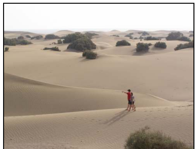
Maspalomas dunes natural reserve, Gran Canaria

It can develop specific planning or management proposals and agreements, collaboration between administrations, hard and soft constructions, etc. The effectiveness of the consortium has been high. In the first six months of existence: it has developed a Plan for the restoration of the tourist areas, the first (out of two) objectives to achieve. I felt very strongly that similar areas in Teramo Province can be served the same way and when I returned to Italy I immediately began to see if my colleagues from different departments and bureaus were interested to set up a similar instrument. The response I got was extremely positive and I have been given a green light to form a similar consortium to develop those areas in the province required regeneration”.