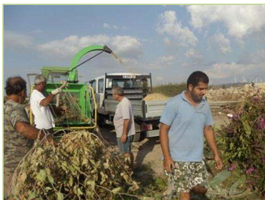
The President of Kouklia Community and colleagues working with the wood shredders.

“Our community has made sustainability a standing agenda item on our agenda. Already more than 50% of our energy production is from renewable resources, compared to the overall EU Member State target of 20% by the year 2020. During my visit to the Netherlands entitled “Opportunities for new member states”, the partners were shown Dutch footpaths and cycle tracks made from local, natural products - in this case sea-shells - instead of asphalt. I discussed whether our green, organic, agricultural waste viz. trimmings could be used as an alternative viable footpath surface to the clay we currently use. Following a positive response and realising this would also improve our waste management policy, the community decided to invest €20000 in a wood-shredder earlier this year. After several months of operation, the shredder is producing ca. 4t/hr of shredded material.